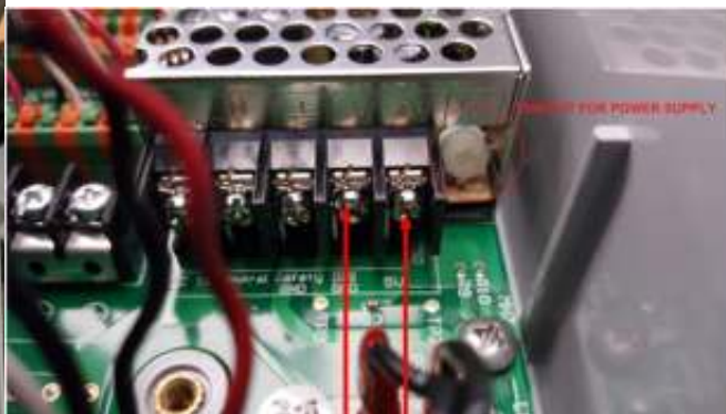
W100 or W600