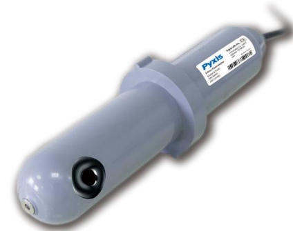
Figure 1 - ST-590 Inline Fluorescent Polymer Sensor

The ST-590 may be used as a stand-alone monitoring and control sensor for active polymer only or it may be used in conjunction with the Pyxis ST-500 inline PTSA sensor. Providing PTSA ( Total Chemical Dosed ) and Fluorescent Polymer ( Active Polymer Concentration ) measurement enables water treatment experts to “dial-in” the system performance to a level not previously attainable in the marketplace with conventional real-time methods. Through extensive research, Pyxis Lab has mastered this technology and embedded the coding necessary to compensate for color, turbidity and dual fluorophore overlap within the sensors themselves, enabling the user to instantly have “PTSA and Fluorescent Polymer” feed and control using any microprocessor controller, PLC or DCS.