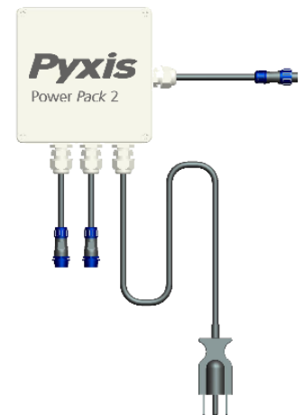
Figure 2 - PowerPACK-2 for ST-500 & ST-590