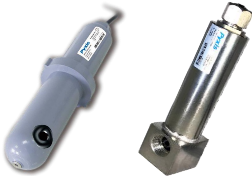
Figure 1 - ST-588 and ST-588SS Inline PTSA & Fluorescent Polymer Combination Sensors

The ST-588 offers Pyxis proprietary algorithms to determine the concentrations of PTSA and active polymer residual simultaneously while measuring sample turbidity and color in highly contaminated waters (ie. \leq 150 NTU and 10 ppm Fe) for internal compensation. The ST-588 offers a combination of dual (2x) 4-20mA as well as RS-485 Modbus output signals, one for PTSA and one for Fluorescent Polymer. The ST-588 is Bluetooth Enabled for wireless cleanliness diagnostics and calibration when used with MA-CR Bluetooth or PowerPACK Series Bluetooth Adapters and the uPyxis APP for Mobile or Desktop devices. The ST-588 is provided in CPVC with the standard Pyxis ST-001 inline \frac{3}{4} " FNPT Tee assembly, 5-foot bulk-head cable with quick adapter and 1.5ft flying lead cable with quick adapter, enabling rapid wiring to any microprocessor controller, PLC or DCS system. The ST-588SS is offered in 304L Stainless Steel with \frac{3}{4} " FNPT ports for high pressure applications.