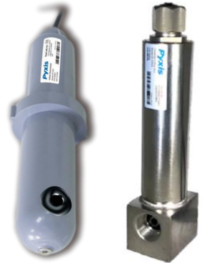
HM-500 & HM-500SS Series Oil In Water Sensors

The Pyxis HM-500 series inline fluorometer sensors measure the concentration of oil in water read as ppm Marine Crude-Offshore Oil. The sensors utilize an LED sourced UV-fluorescence methodology at 365nm wavelength and 410/470nm excitation. Pyxis HM-500 series sensors are uniquely designed with extra photo-electric components that also monitor the color and turbidity of the sample water. This proprietary feature enables the HM-500 series to automatically compensate for color and turbidity in the water sample eliminating interferences commonly associated with real-world waters, up to 150NTU. The Pyxis HM-500 series inline sensors have a short fluidic channel and can be easily cleaned. The fluidic and optical arrangement of the HM-500 series are designed to overcome shortcomings associated with other fluorometers that have a distal sensor surface or a long, narrow fluidic cell. Traditional inline fluorometers are susceptible to color/turbidity interference and fouling and can also be very difficult to clean. These unique features provide HM-500 series with a level of accuracy far greater than conventional inline oil in water sensors and enable users to conduct wireless inline sensor cleanliness diagnostics as a predictive measure via the uPyxis APP for mobile and desktop devices.